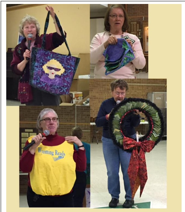
Show and Tell

Repairing ALL Makes & Models Since 1992!